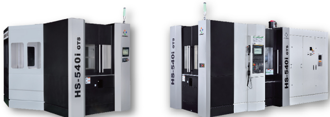
8 Pallets Expansion Unit