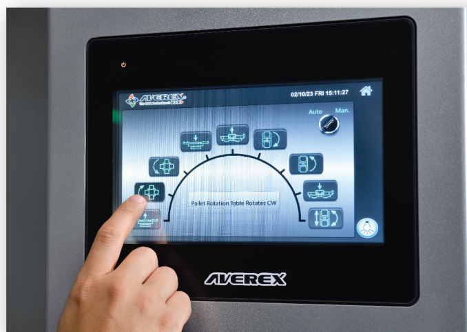
HMI 8APC Operation